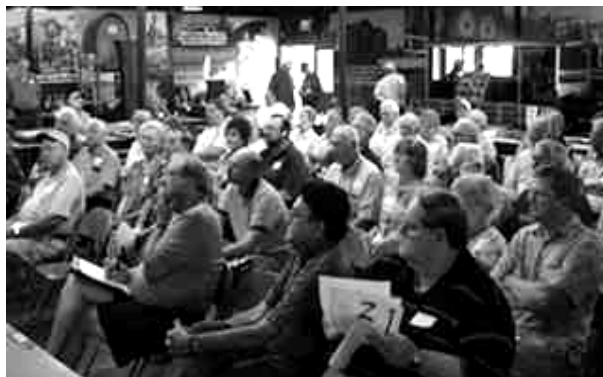
Bidders earnestly await the announcement of the next auction item.