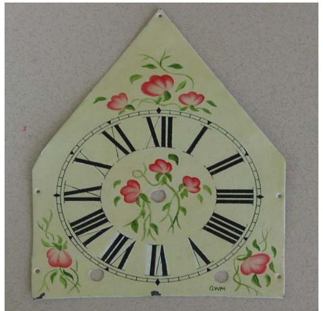
Gary Mowery painted the flowers on this dial. Quite remarkable for a first try.